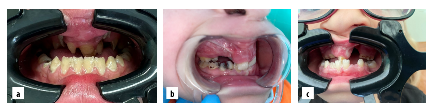
Fig. 3. Patients with congenital bilateral complete cleft lip, alveolar process, hard and soft palate (a,b,c).

The examined contingent of patients that operated at National Specialized Children's Hospital "OKHMATDYT" with congenital complete combined cleft of the maxil-