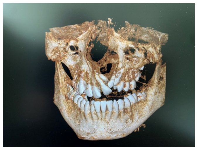
Fig. 2. Patient with congenital unilateral complete cleft lip, alveolar process, hard and soft palate.

with bilateral cleft were affected by caries – only 1.82% (2 children) had intact teeth. Complicated caries in children with bilateral cleft palate was higher than with unilateral and stated 27%.