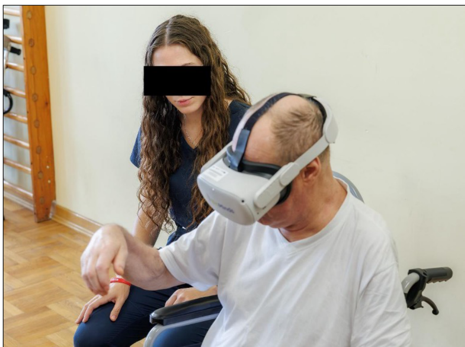
Fig. 1. Patient during the VR therapeutic session.

Statistical analyses were performed using the NCSS 20 statistical package. The results of the scales were analyzed by group and time point and compared using two-way analysis of variance and post-hoc Tukey's test. A p-value of <0.05 was considered statistically significant and a p-value of <0.01 was considered highly significant.