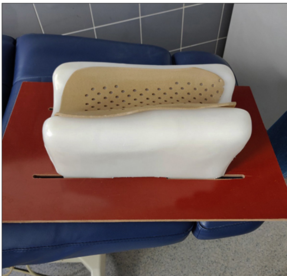
Fig. 1. Ankle-foot joint ultrasound device

Today, sonography is becoming increasingly important in assessing the condition of the ligamentous apparatus of the joints, and the sensitivity of ultrasound in detecting injuries to the anterior calcaneal-fibular ligament is up to 93% [8]. Dynamic examination in the form of stress tests makes it possible to sonographically assess the degree of joint instability, simultaneously determine the condition of the ligaments of the contralateral joint and conduct a comparative analysis [9]. Thus, in case of ankle-foot joint damage, ATFL ultrasound assessment is a highly reliable procedure due to the practicality of both dynamic and static assessment of the ligament condition [10].